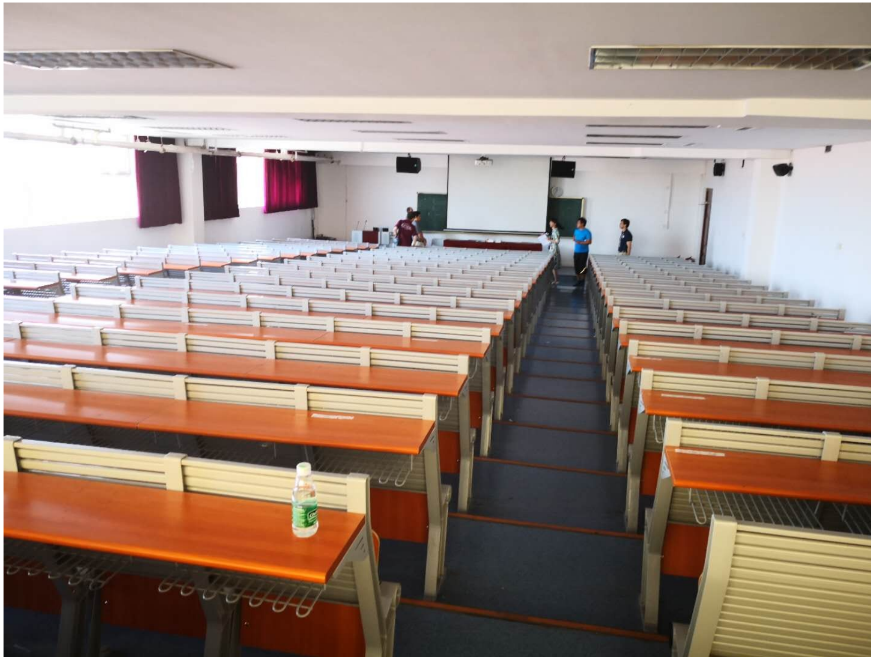
Amphitheater for referee meetings